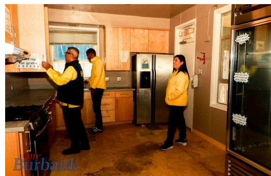
IKEA Burbank to support with Kitchen Remodel