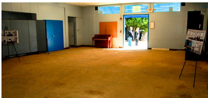
Future Case Management Offices and Community Room