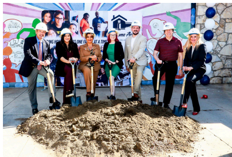
Supported by City of Burbank