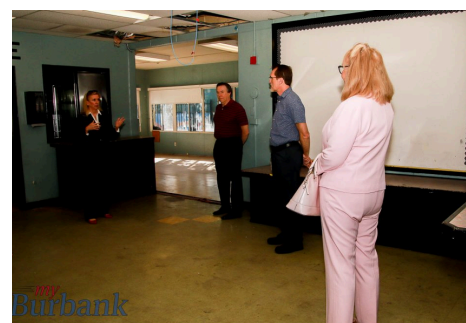
Future Intake Office